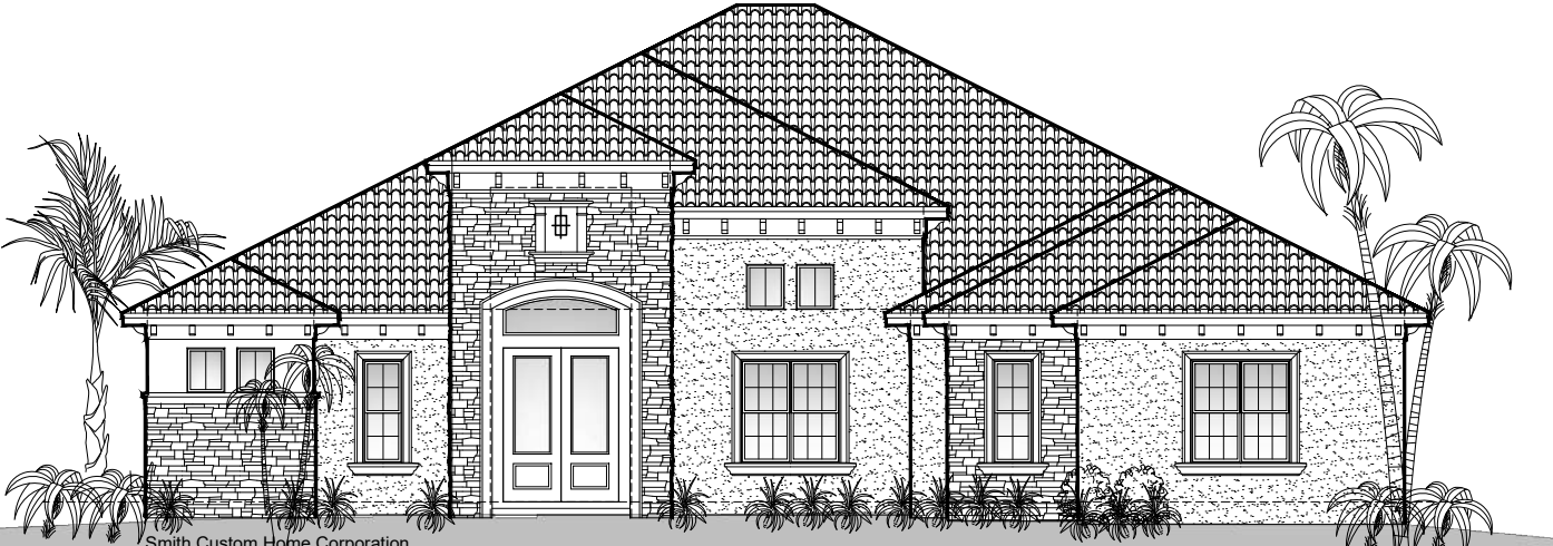
Monet Tuscan Elevation

ALL DESIGNS AND ILLUSTRATIONS CONTAINED IN THIS PUBLICATION ARE THE EXCLUSIVE PROPERTY OF SMITH CUSTOM HOME CORPORATION. ANY REPRODUCTION IN WHOLE OR IN PART IS STRICTLY PROHIBITED.